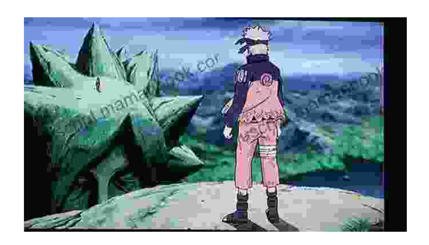
Naruto and Sasuke facing off in the Valley of the End